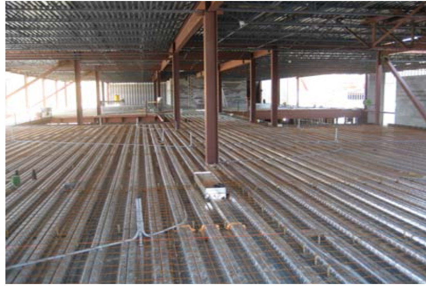
April 17, 2009 - The balance of the 2nd floor deck electrical rough in is complete, steel reinforcing mesh is installed and ready for pour