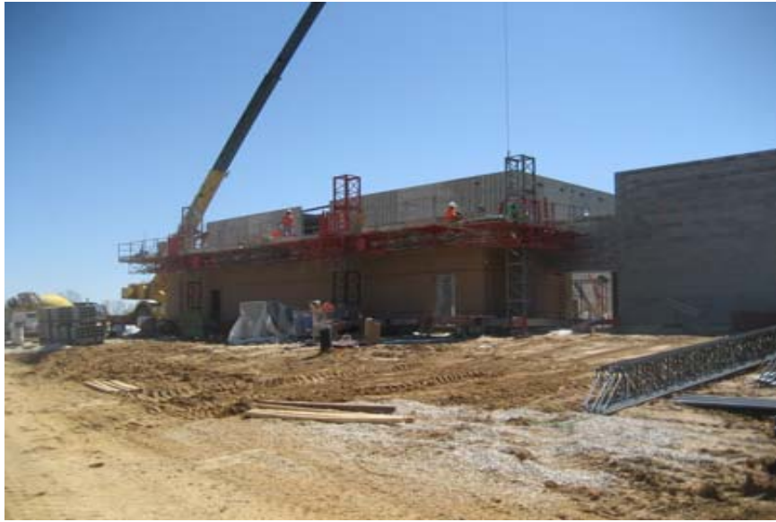
April 3, 2009 - Finishing the west load bearing CMU wall of the music rooms