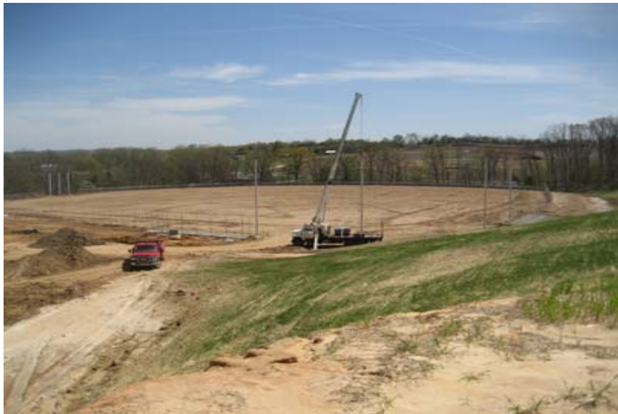
April 24, 2009 - Baseball field backstop posts are set, dugouts are poured, and scoreboard supports are installed