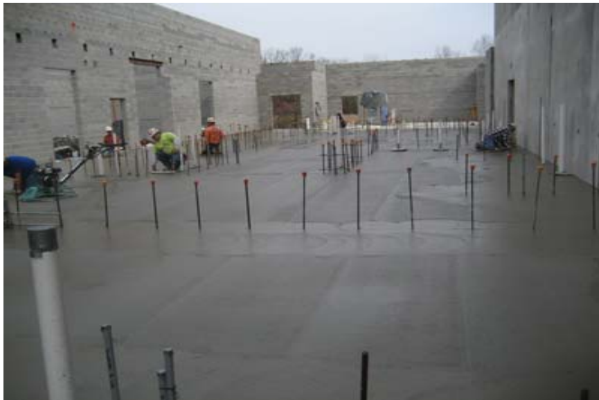
April 9, 2009 - Locker rooms and corridor floor slab-on-grade poured and finished