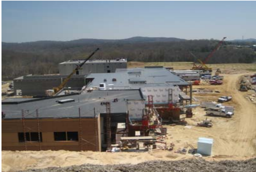
April 17, 2009 - Roof installed on the A1 portion, roof deck installed on the balance of the building, brick veneer work completed on the west elevation