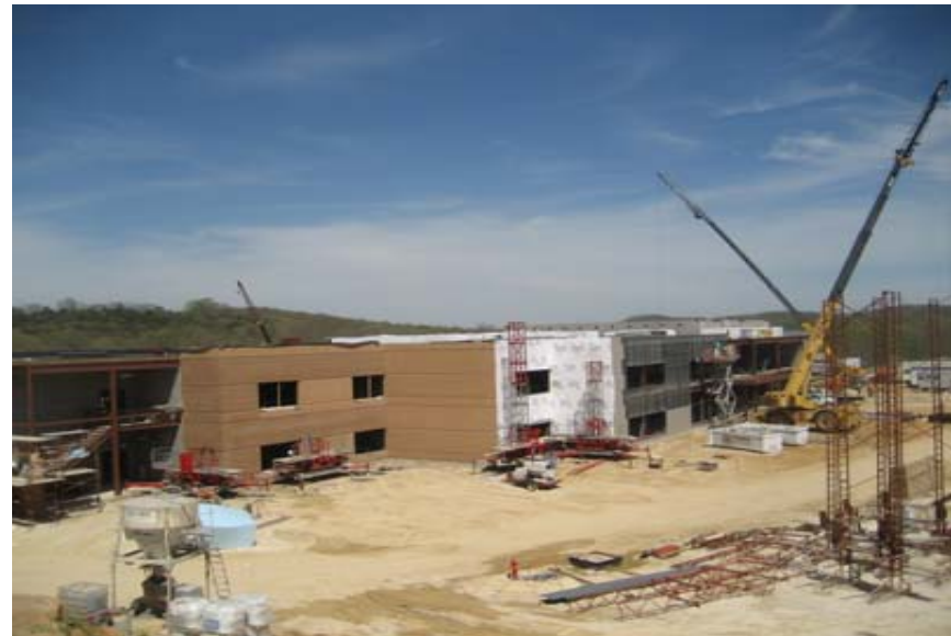
April 24, 2009 - Progress of masonry work around south building elevation