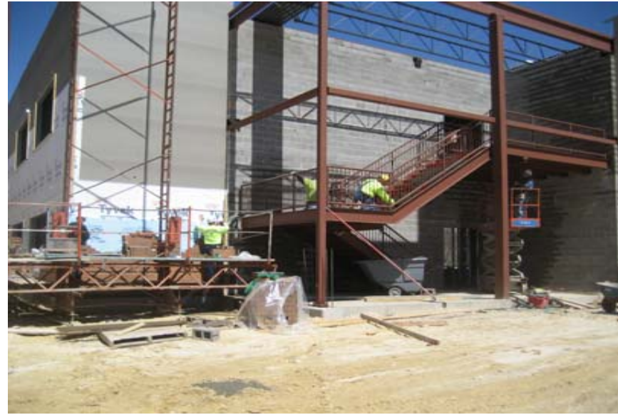
April 3, 2009 - Pouring the concrete pan stairs and landings at the SW stair tower